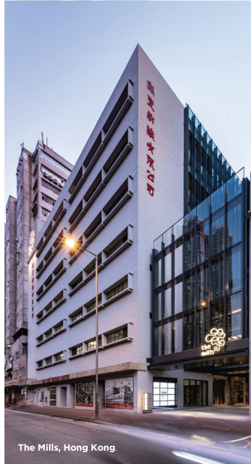
The Mills, Hong Kong