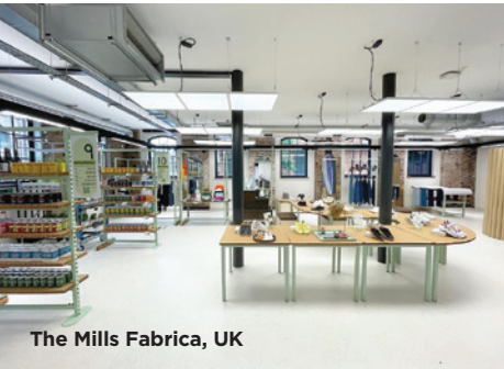
The Mills Fabrica, UK

Net proceeds from SFTs pending allocation will be held in accordance with the Group’s internal liquidity guidelines including investments in short term time deposits or investments or repay existing borrowings of the Group.