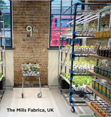
The Mills Fabrica, UK

Launched by the Building and Construction Authority (BCA) of Singapore, the BCA Green Mark is a benchmarking scheme that supports sustainably-built environments in environmental design and construction and the adoption of green technologies. The BCA Green Mark Scheme rates buildings according to five key criteria, including energy efficiency, water efficiency, environmental protection, indoor environmental quality, and other green and innovative features that contribute to better building performance. The building assessment will grant buildings one of four Green Mark Ratings: Green Mark Certified, Gold, GoldPlus or Platinum Award. BCA will conduct site verification upon project completion. For more information, please visit https://www1.bca.gov.sg/buildsg/sustainability/green-mark-certification-scheme .