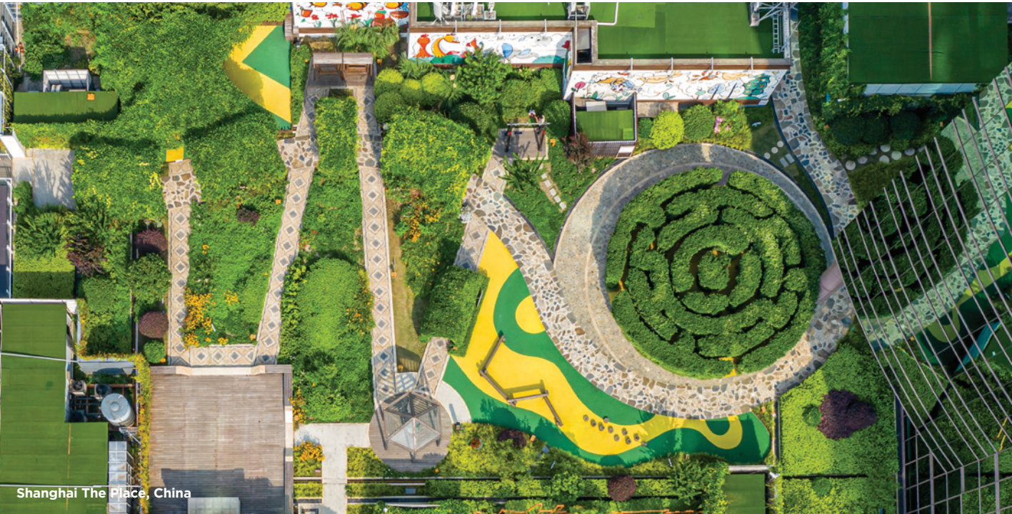
Shanghai The Place, China