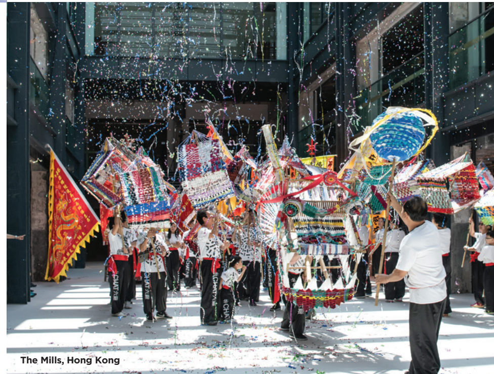
The Mills, Hong Kong

The Mills is a landmark revitalization project where the Group successfully transformed Tsuen Wan's former spinning factories into a multidisciplinary destination with an experiential shopfloor, cultural gallery, and start-up ecosystem builder. A UNSECO award winning development, The Mills envisions to be a hub where innovation, heritage, and creativity intersect: through weaving unique experiences and co-learning opportunities, we bring together communities for a more socially coherent, resilient society.