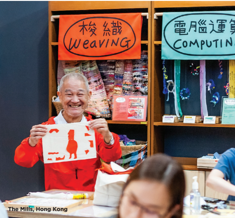
The Mills, Hong Kong

Nan Fung has implemented several key initiatives aimed at achieving positive environmental and social impact. A summary of these initiatives are as per below: