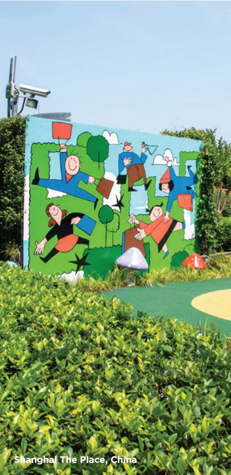
Shanghai The Place, China