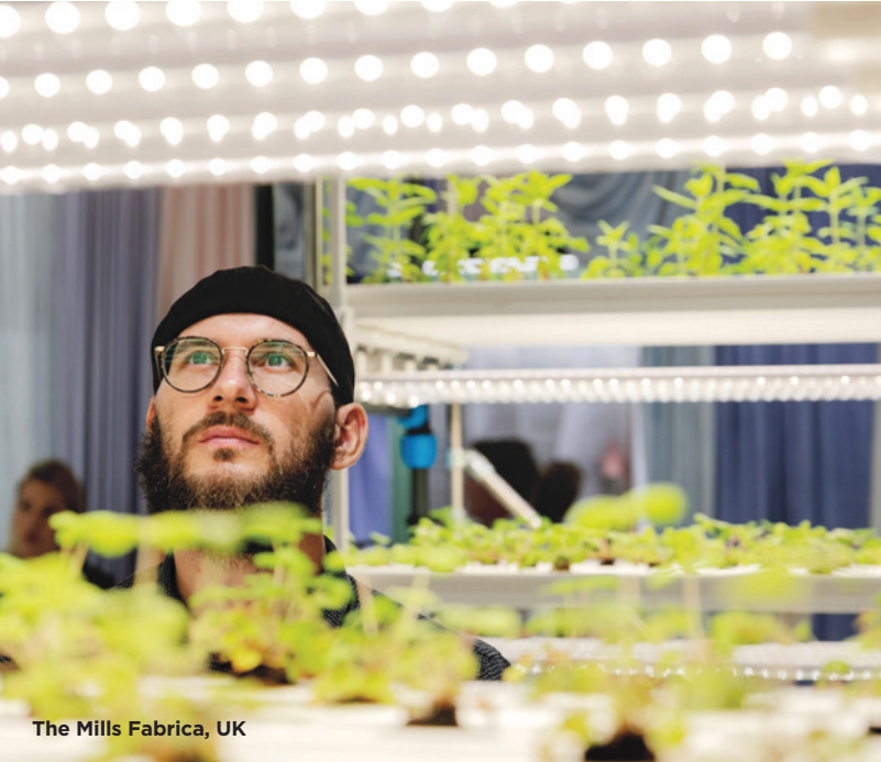
The Mills Fabrica, UK

The Group will look to achieve its ESG targets through the pursuit of the following initiatives: