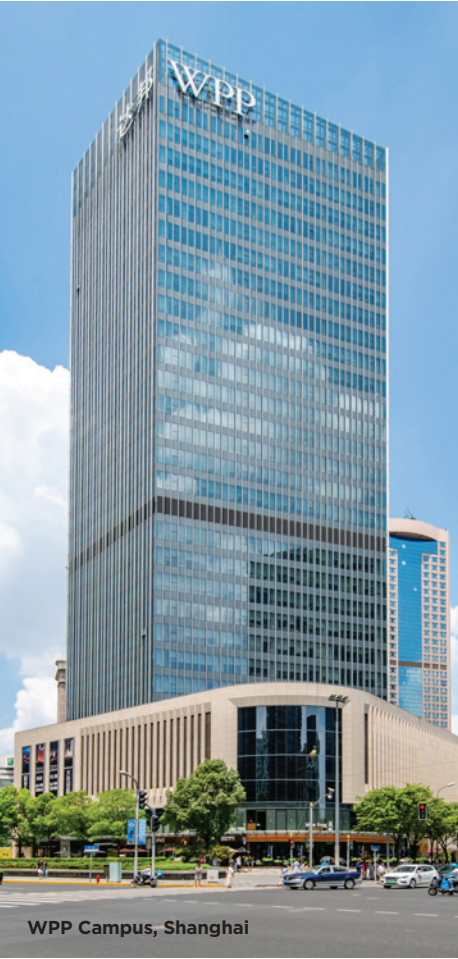
WPP Campus, Shanghai

The Second Party Opinion, as well as the Sustainable Finance Framework hereof will be published and made available at https://www.nanfung.com/en/